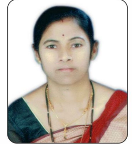
Indubai Anil Kale Dnyaneshwar Motors Chandwad - Maharashtra